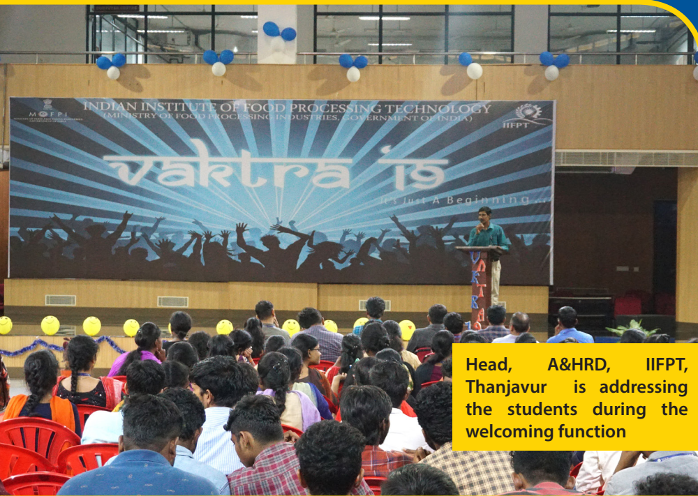
Head, A&HRD, IIFPT, Thanjavur is addressing the students during the welcoming function